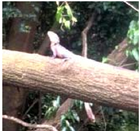
The water dragon

The tide had turned and was with us on the return trip. I noticed a few 4km maritime speed limit signs which, together with the boat ramps, indicated the creek is used for boating. But today we had the waterway to ourselves.