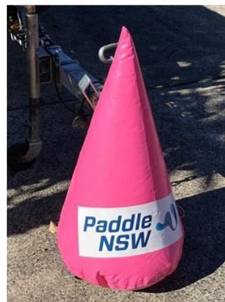
PNSW Pink Separation Buoys – keep these to your left .