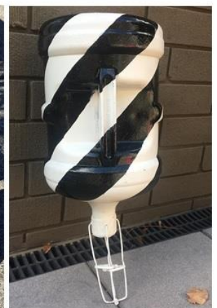
Striped Hazard Buoys are part of the course . Do not go shoreside of these