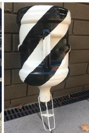
Striped Hazard Buoys are part of the course . Do not go shoreside of these