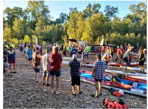
The Start Knobbies Waterhole

I can't believe, I have started thinking of doing this race again. It was such a hard slog getting to the start line and back again, that I never thought I would think of going back, but there is something special about this race. You don't realise it until you are on the water, but it is set in some of the most picturesque scenery you will ever see.