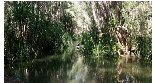
Ohh "The Pandanus"