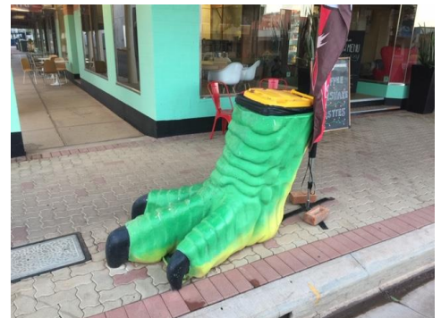
The Dinosaur Trail, Winton. QLD