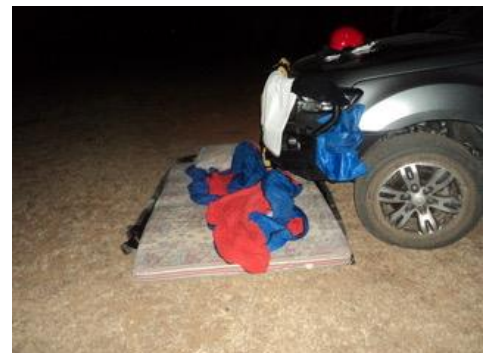
5 star accommodation