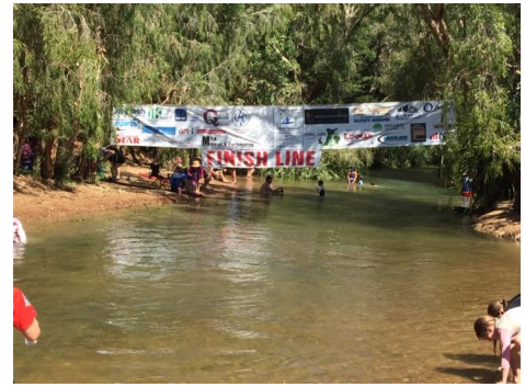
The Finish "The Bridge"